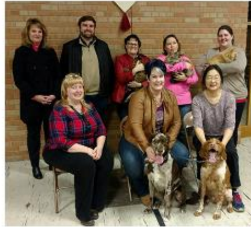
LAKE AREA PET PANTRY – This photo included board members of the then newly formed Lake Area Pet Pantry which received a grant from Giving Back 365 donors in 2016. The group’s effort assists pet owners with temporary financial need. More information can be found at www.lakeareapetpantry.org or on Facebook. Drop boxes for pet food and kitty litter are at Glacial Lake Clinic, Care Small Animal Clinic, Critter Mart and Ritual Addictions.

The numbers and impact of foundation grants to the dogs is impressive over the past 40 years – even more-so when you consider that’s about 240 in dog years.