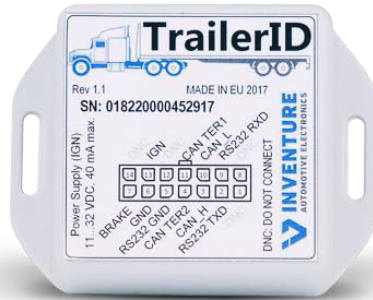
Figure 2 – Receiver module connectors