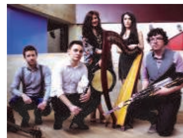
Week 3: Connla (Ireland)