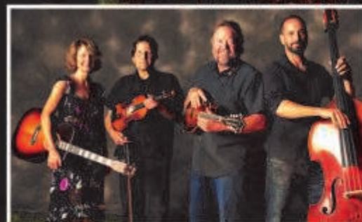
Eastman String Band