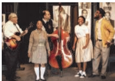
Week 1: Mad River Theater