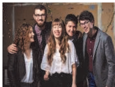
Week 2: Mile Twelve