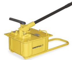
Large Capacity Pump