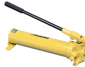
Small Capacity Pump