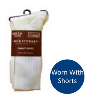
Sock Anklet 2 pkt