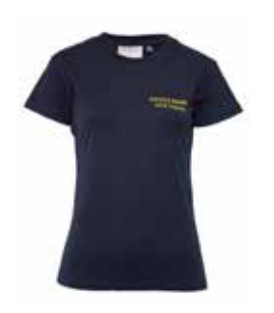
VCE Dance T-Shirt