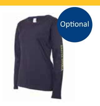
Sports T Long Sleeve