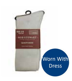
Knee High Sock 2pkt