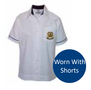
Blouse Short Sleeve