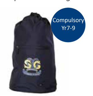
Havasak Sports Bag