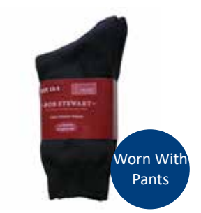
Sock Crew Navy 3pkt