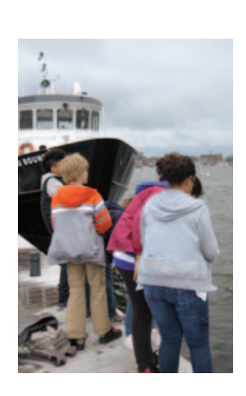
Thompson Island Outward Bound Education Center, a key partner in youth programs at Boston Harbor Islands, helps transport urban youth to program activities in the island park.

Broadening the public's perception of national parks is challenging because it requires a cultural change within and outside of the NPS. Study interviewees noted that it is important to help the public to understand the variety of parks within the national system beyond the traditional, natural resource-based parks, and the many benefits that the system can provide to American society.