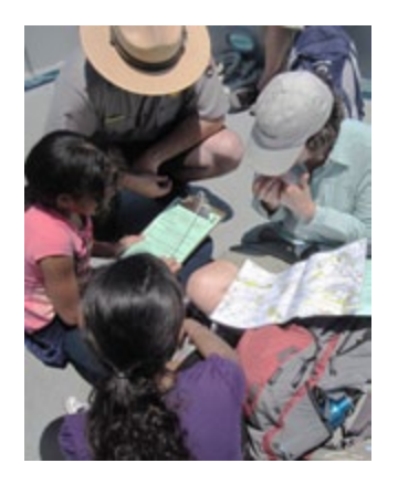
While on their way to Lovells Island, students check a harbor chart and prepare for a Harbor Connections field trip with their teacher and an NPS ranger.

The 25 participants in the initial scoping interviews identified six elements of successful National Park Service diversity initiatives: staff involvement with local communities, inclusive interpretation and stories, effective communication and use of media, a supportive NPS climate, a diverse workforce, and program sustainability. Subsequent analysis of the research data found that these elements are in fact "long-term outcomes" of effective deep engagement, and they are identified as such in chapters 2 and 5. The scoping interviews also highlighted three systemwide opportunities for enhancing relevancy programming.