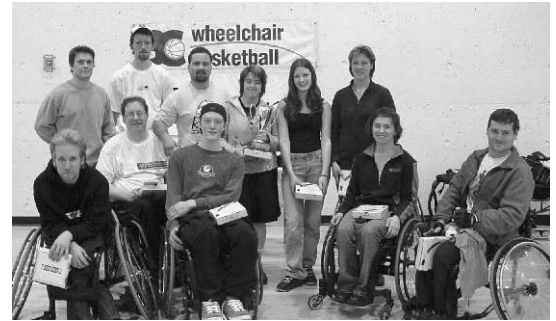
Oceanside Tsunami, BC-CWBL Division 2 Champs.