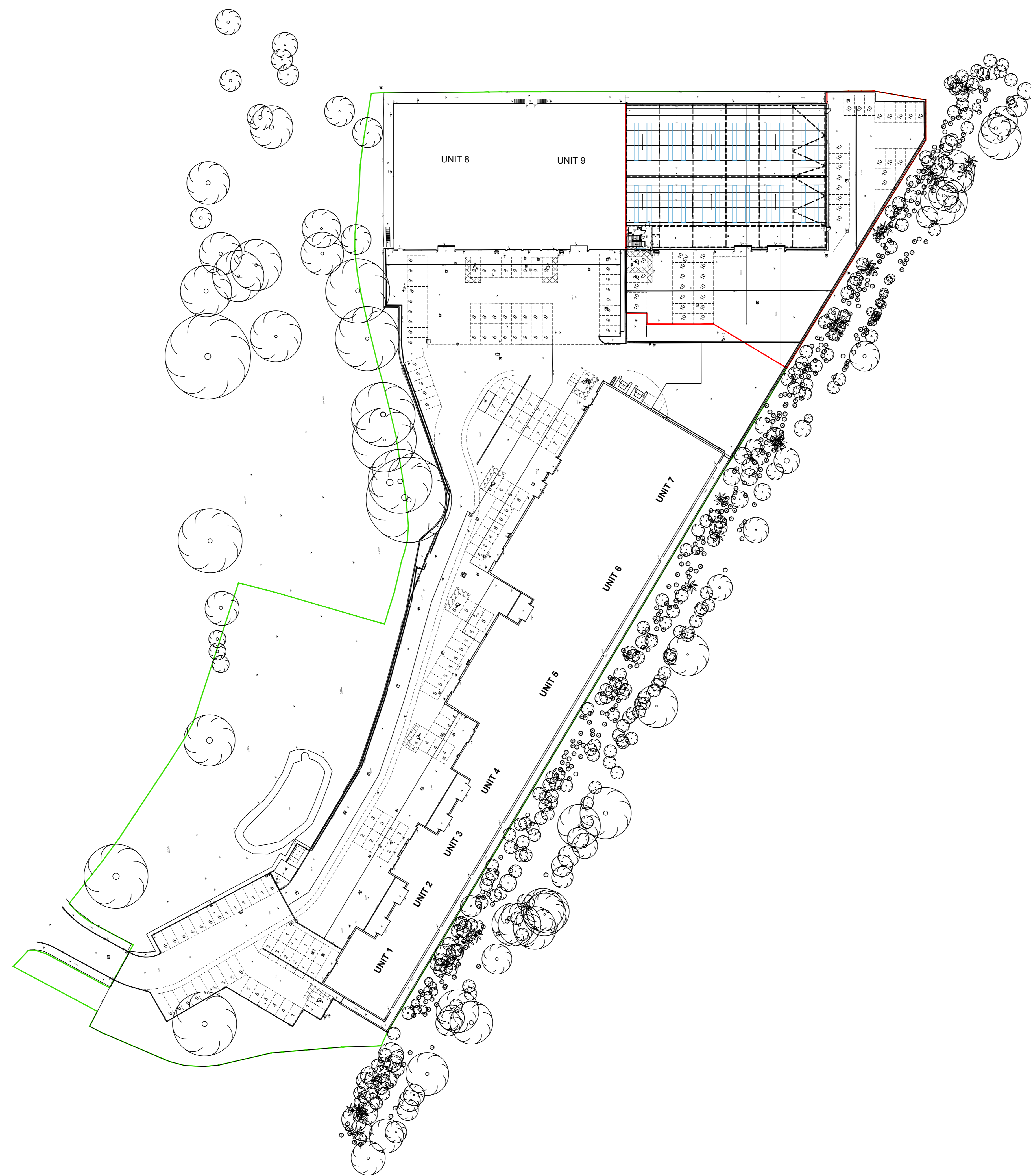
SITE PLAN 1: 500