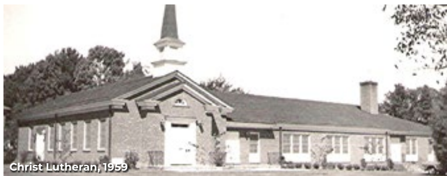
Christ Lutheran, 1959