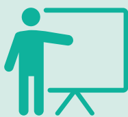
Raise demand/awareness of products and services

Bring together different agencies that support start-ups at different stages of entrepreneurship