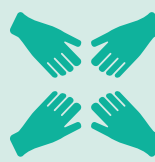
Collaboration or projects