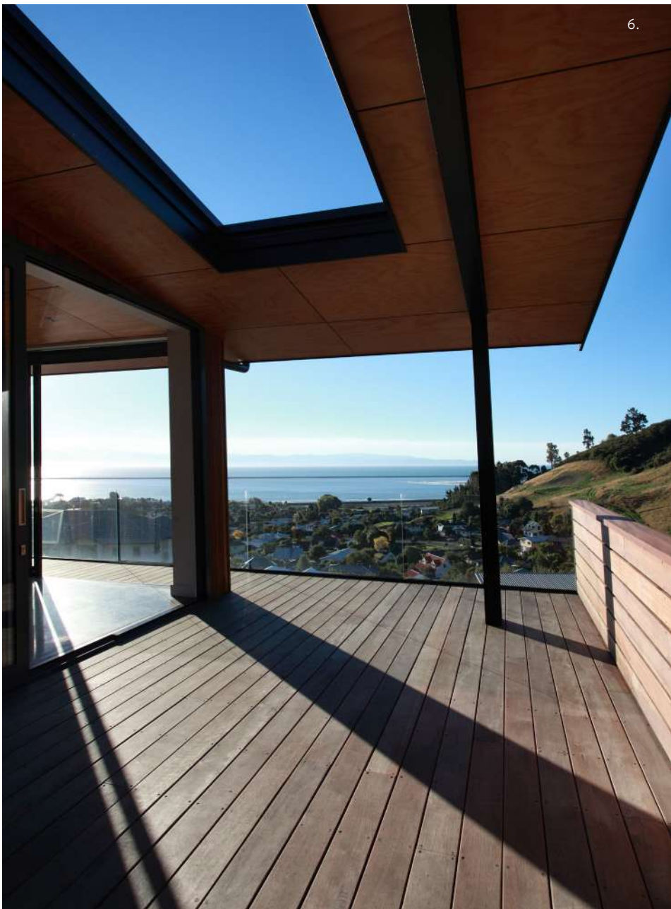
1. The living room opens out onto a large covered terrace with views over the boulder bank 2. Private terrace from the bedrooms with view towards Nelson and the port 3. Vertical cedar screens the entry platform 4. Gangplank entry platform 5. Terrace wraps around the back of the house connecting to the entry 6. Covered terrace linking to the living room