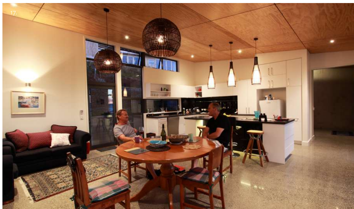
13. View from the sitting room to the terrace 14. Entry with feature passive solar concrete wall and polished concrete floor 15. Evening view looking over the terrace 16. Entry with oversized black pivoting door 17. Open plan kitchen and living with plywood and acoustic ceiling panels