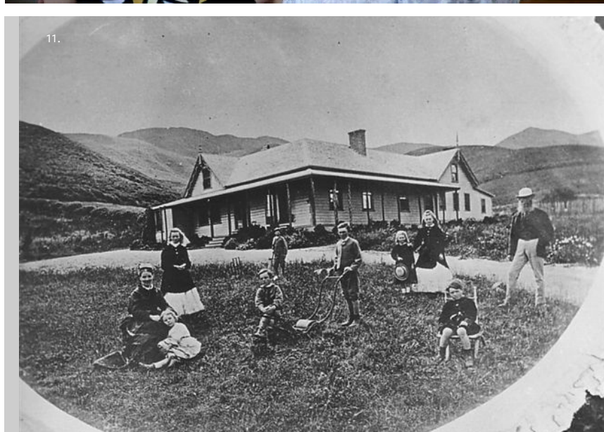
7. LED lights guide the way to the main door 8. Main entry platform and cedar screen 9. Sitting room that can be closed off from the open plan living and kitchen 10. Owners Jae & Nick 11-12. The original homestead