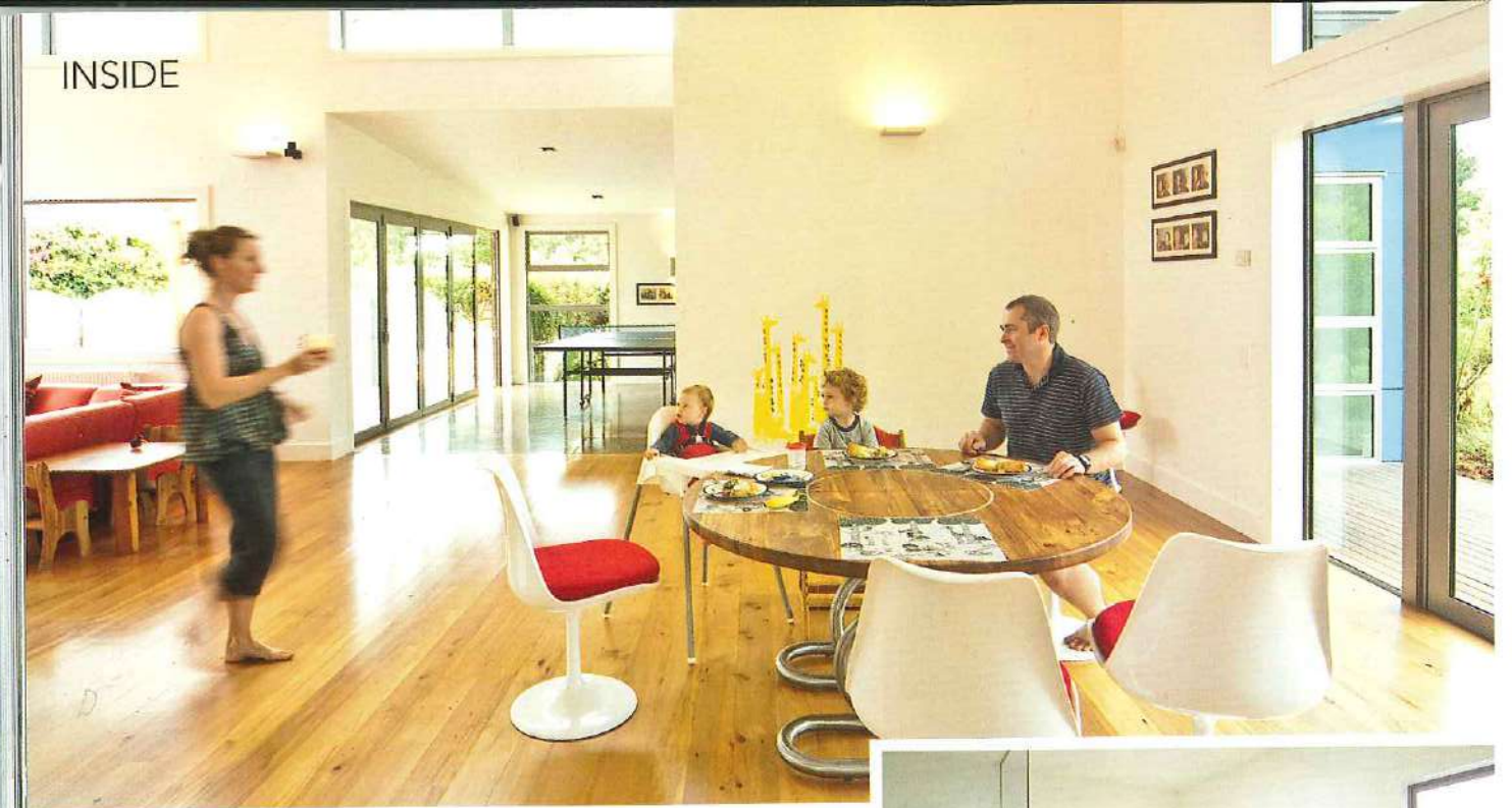
ABOVE: A reclaimed rimu floor adds character to the new home. The modern dining table was specially made by Safari Furniture and is complemented by tulip chairs by Eero Saarinen. RIGHT: The Amalfi slipper bath is from Robertson.