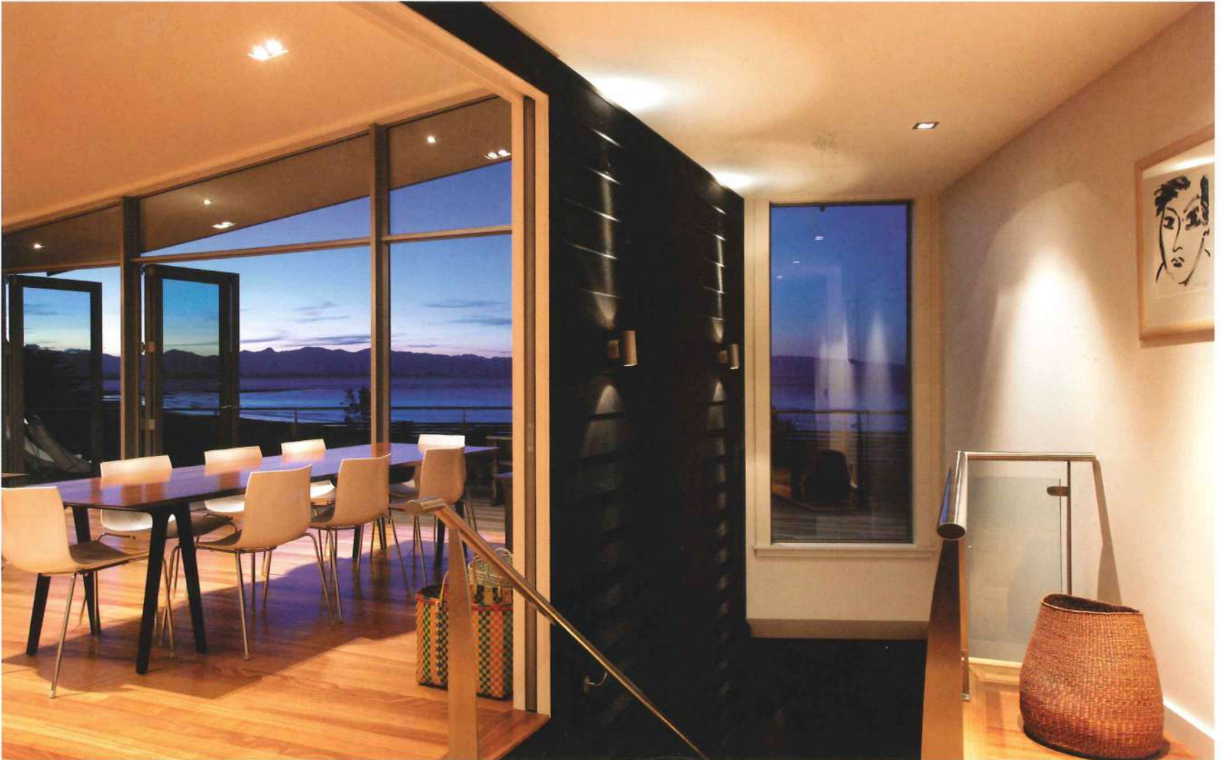
Wallace Marshall House