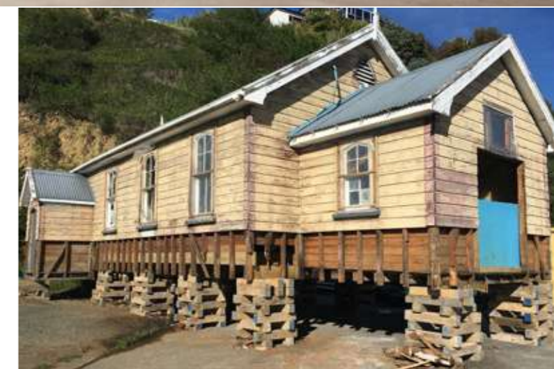
TOP: A beautiful space with an elegant trussed ceiling ABOVE: The renovation included repositioning the chapel

The client proved keen to restore the building but it also had