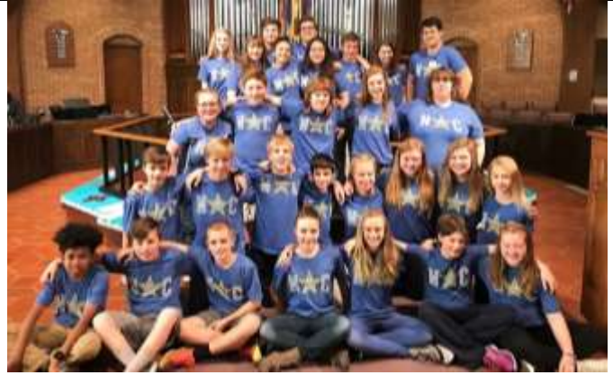
"The Gift of Grace" Youth Sunday 2017