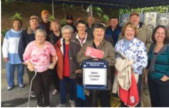
Asheville Tourists Visit on April 27