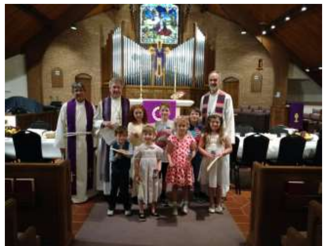
First Communion at Maundy Thursday service.