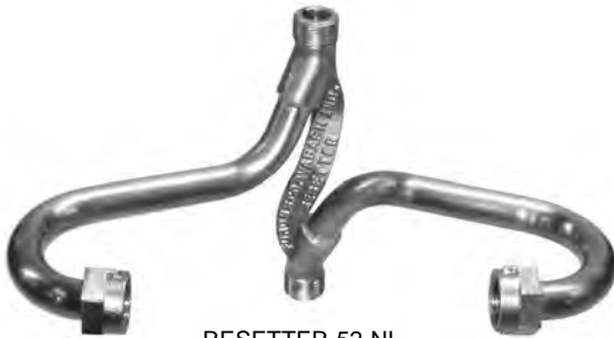
RESETTER-52-NL shown above