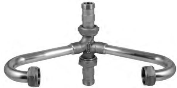
RESETTER-54-NL shown above