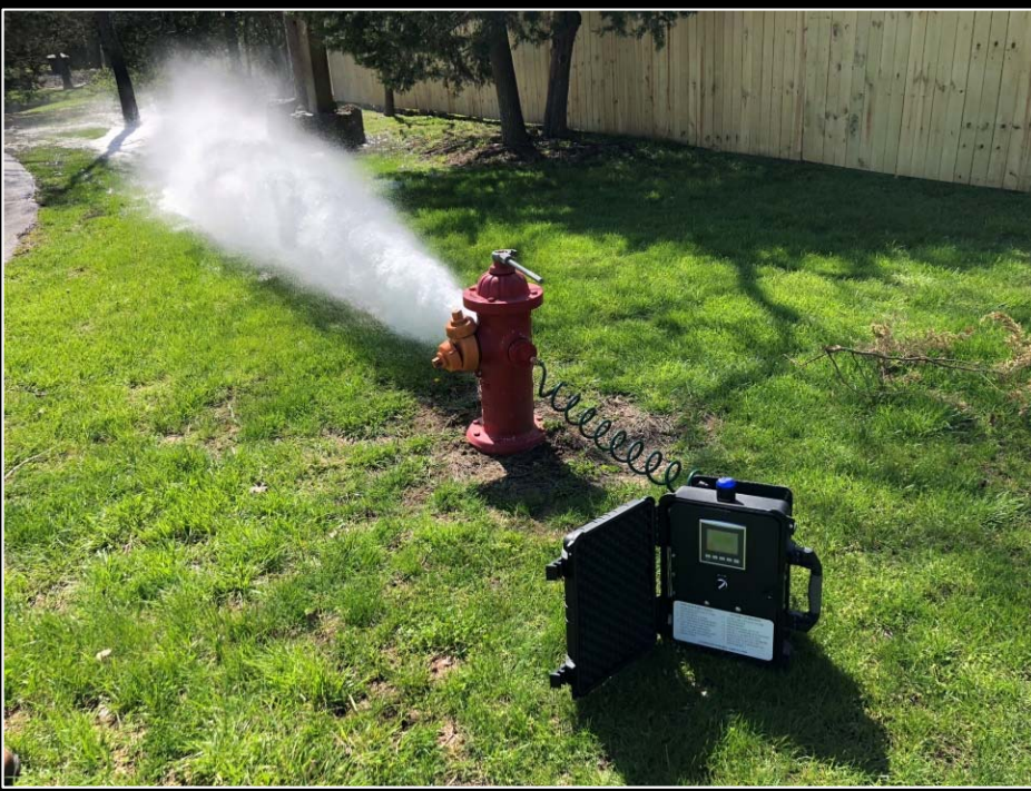
Flushing Buddy with optional hydrant hose attachment