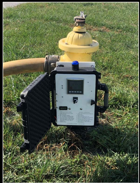
Flushing Buddy attached directly to hydrant