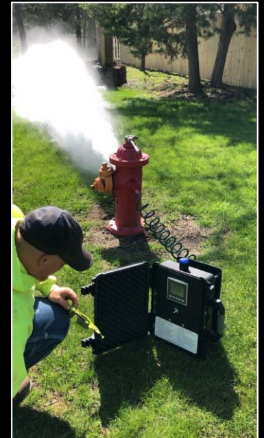
Easy to program and operate