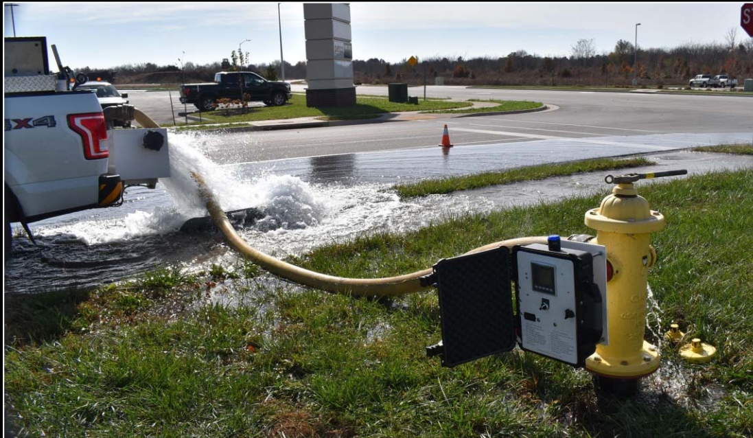
Monitors water quality while flushing and alerts operators with audio-visual alarm when goals have been achieved