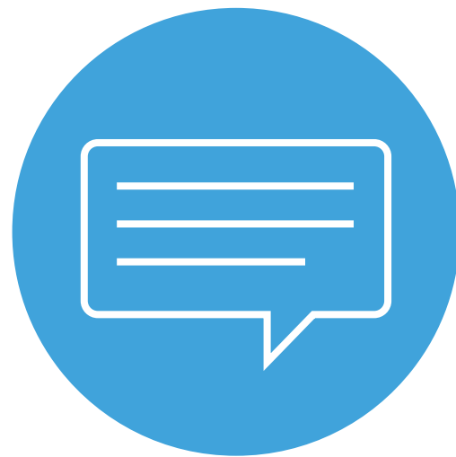
Whitiwhiti Korero Communication