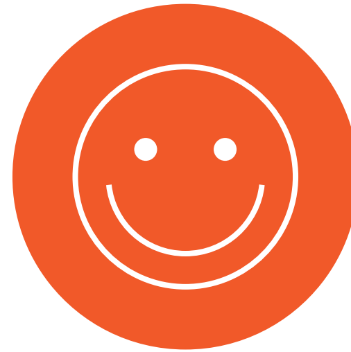
Waiaro Pai Positive attitude