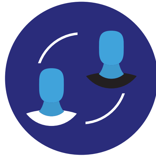
Mahi Ngātahi Teamwork