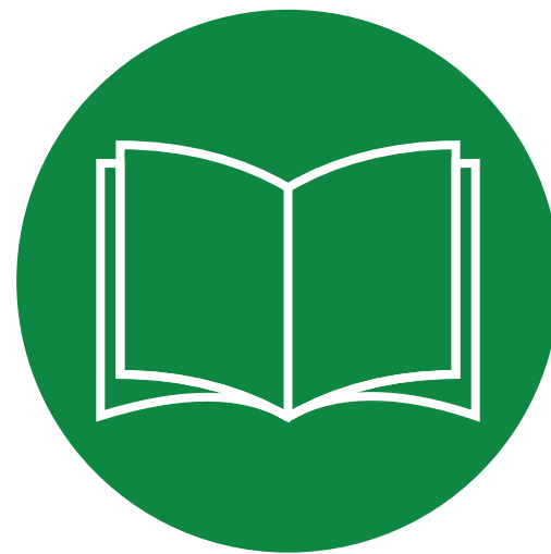
E hiahia ki te Ako Willingness to learn