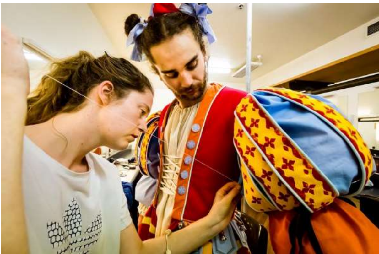
Costume Showcase 2018