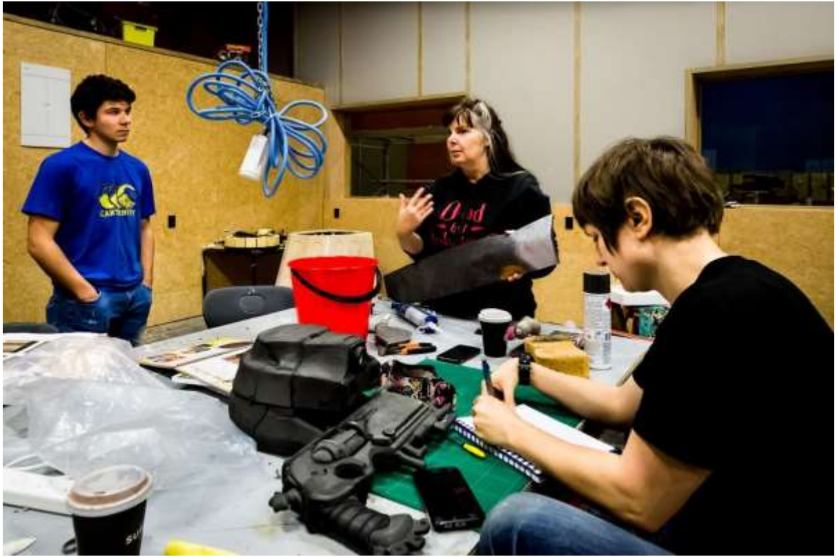
Set & Props Class