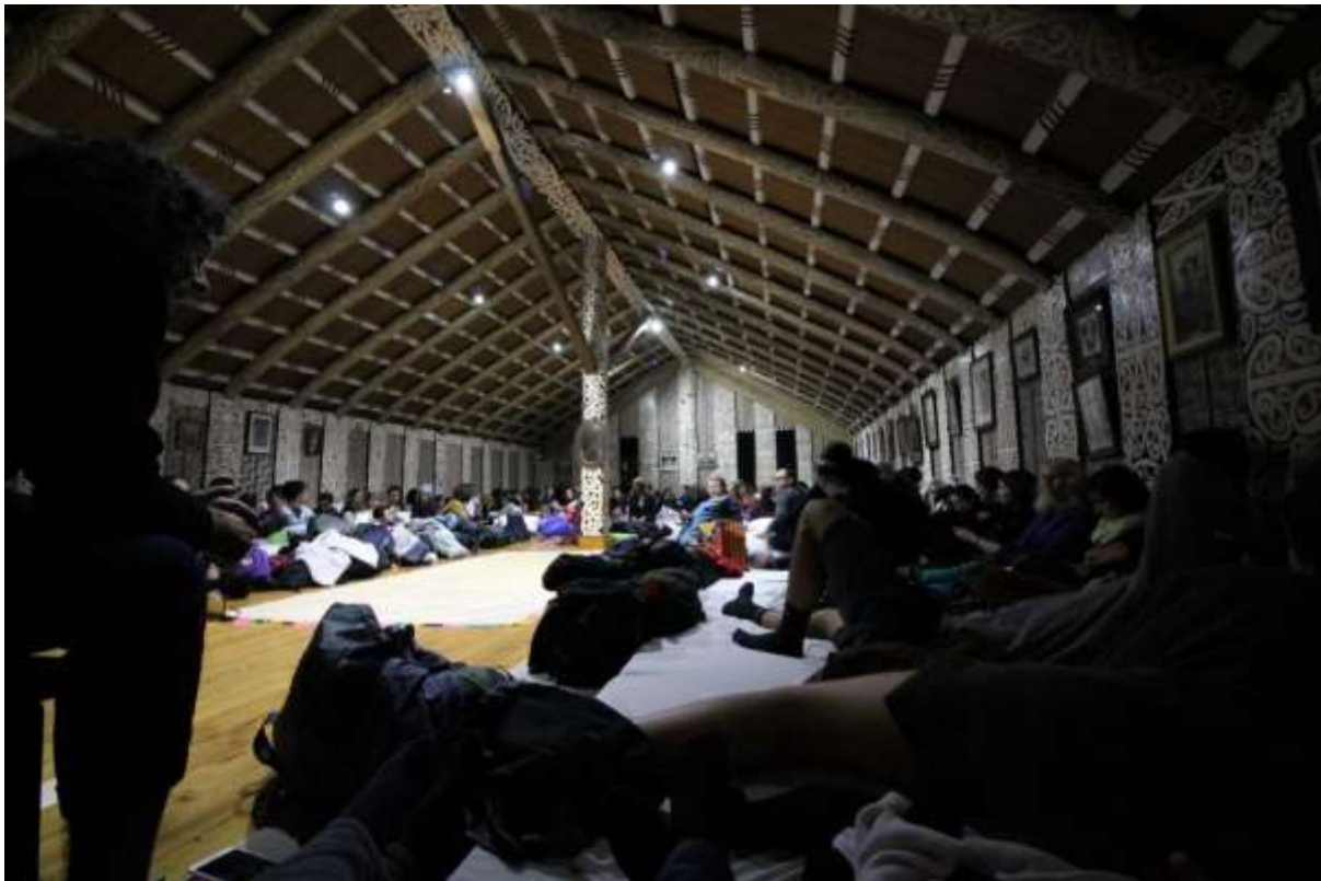
Marae Noho, Manutuke 2017

It is the aim of the School that students will uphold these values, while building professional and artistic relationships with the students and staff who make up this kura.