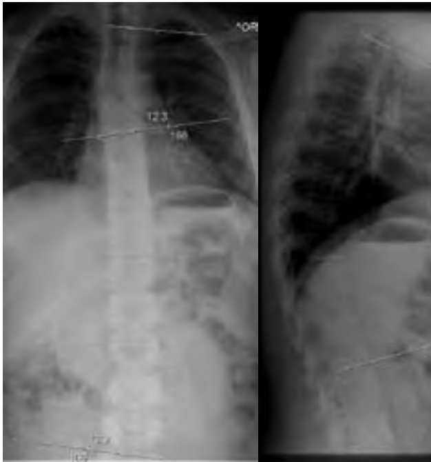
Figure 1 Radiographs of a 13-year-old boy showing a 12° upper right thoracic scoliosis and a 32° kyphosis.

on the right side of female thoracic spines. Scoliosis in pinealectomised chickens is only in the thoracic spine, 8 whereas human idiopathic scoliosis can also occur in the lumbar spine. The thoracolumbar junction was identified as the apex of the scoliotic curve in pinealectomised chickens. 36