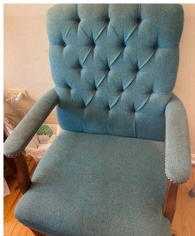
There is just one un-matched, stained chair.