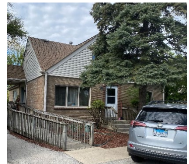
The residents would like outdoor furniture for summer months.

WITH YOUR HELP, WE CAN PROVIDE NEW FURNITURE TO THEM TO ENJOY THIS SUMMER.