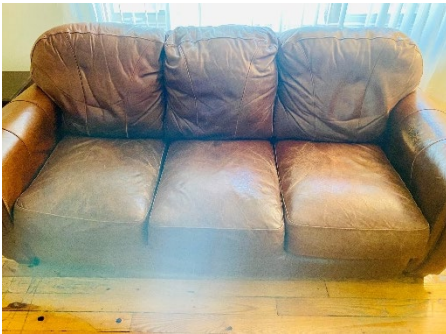
The sofa is not large enough for all five residents. It is old and worn.