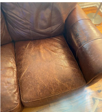
A close-up of the old sofa.