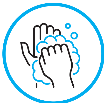
Hygiene and cleaning