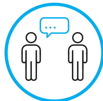
Wellbeing of staff and customers