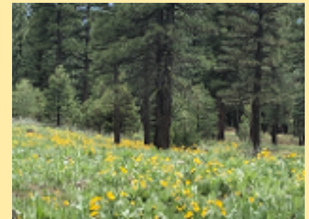
Mule's Ears in all their glory