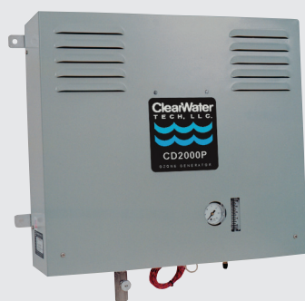
CD2000P Ozone Generator