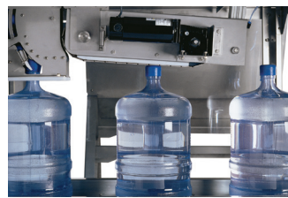
BOTTLED WATER FILL LINES