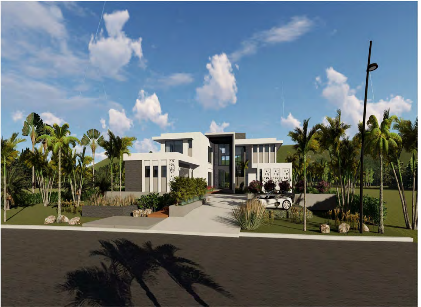
Renderings of proposed home design