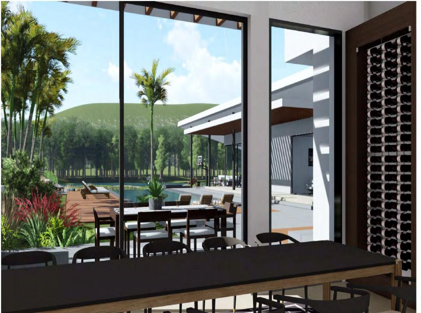
Renderings of proposed home design