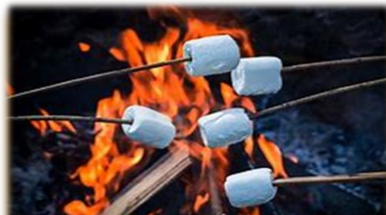
N U M M M M M E E E !!!