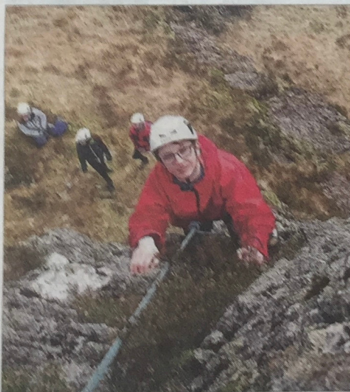
Oban High School pupils took on rock climbing challenges and went on treks across the snow.