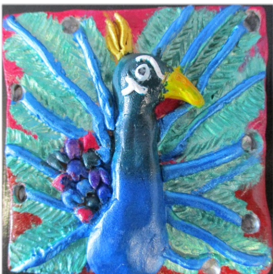
Lilah Furlong Room 15