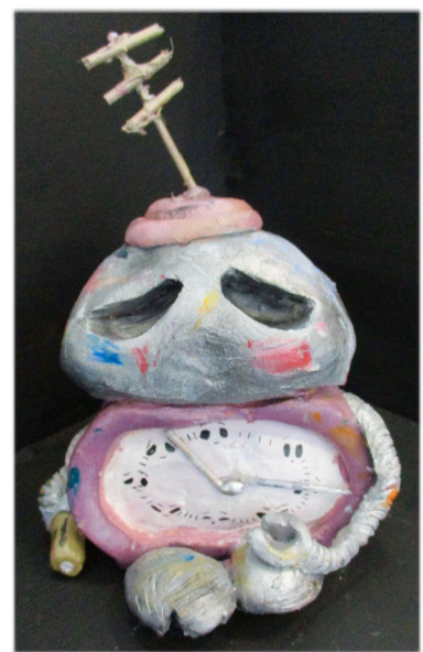
Nicole Zhao Room 14