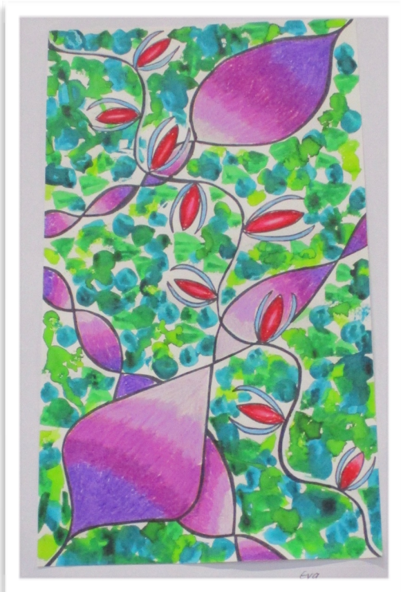
Eva Steckler Room 6