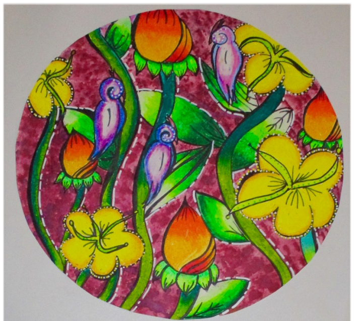
Mikayla Snell Room 3