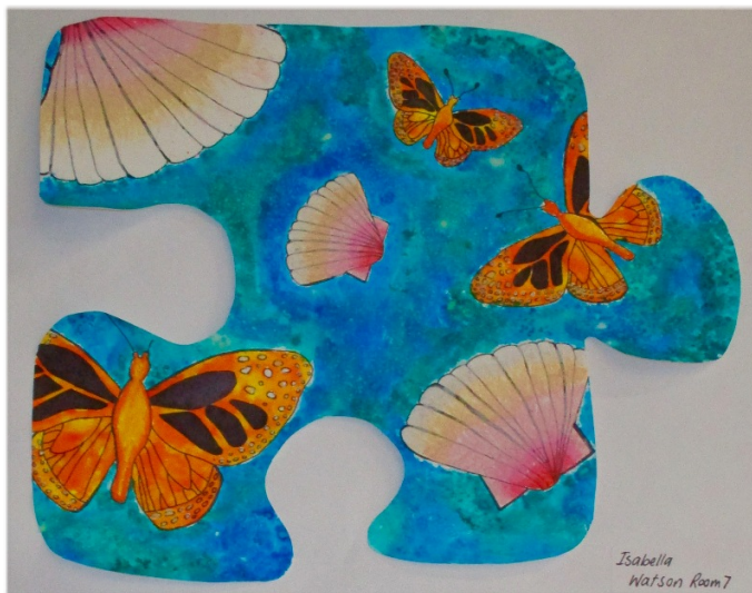
Isabella Watson Room 7