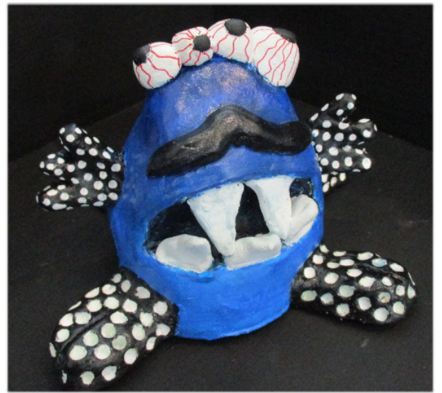
Pippa Laing Room 13