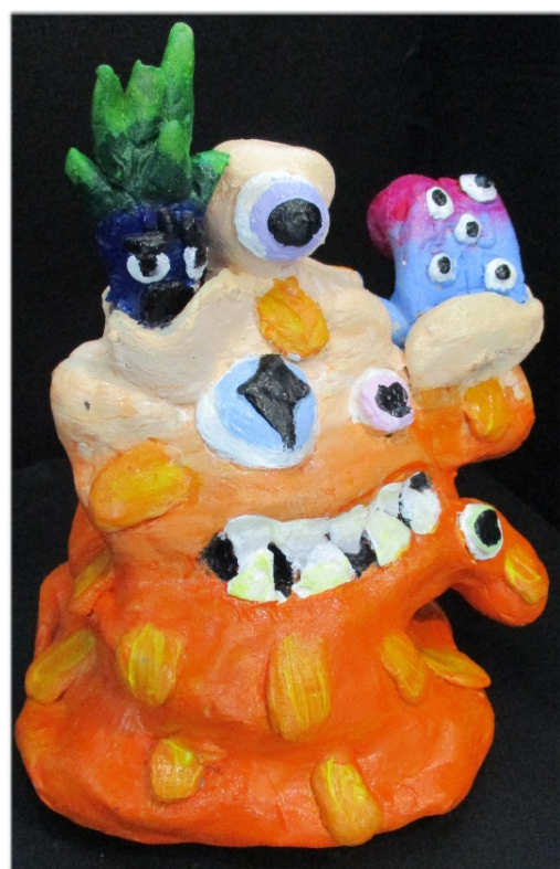
Kaia Schneebeli Room 16