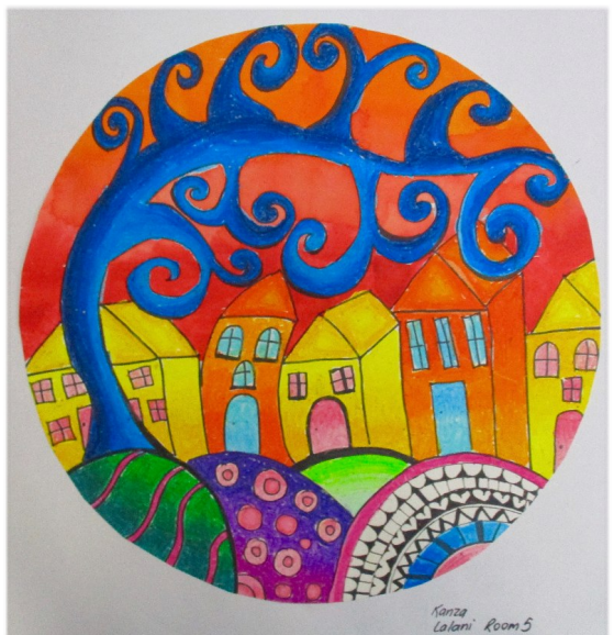
Kanza Lalani Room 5