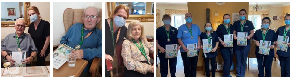
Pictured are just SOME of the staff and residents of Creevy House who took part in the Fun Run

This was such a wonderful effort from all, and showed real teamwork and collaboration between staff and resident. There was a true sense of achievement on completion, with a presentation of medals and certificates.