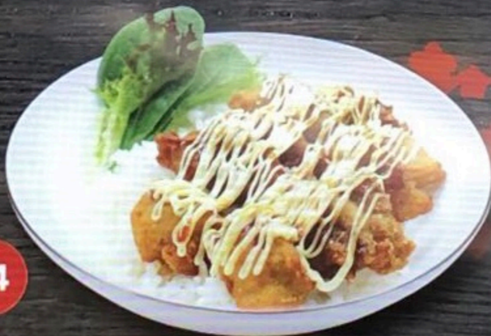
04 KARAAGE CHICKEN $9.8