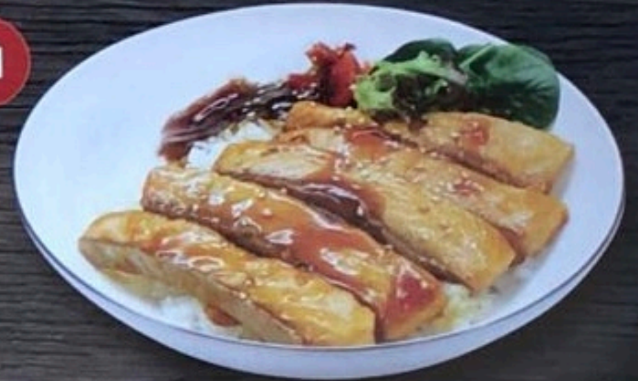
11 TERIYAKI SALMON $12.8