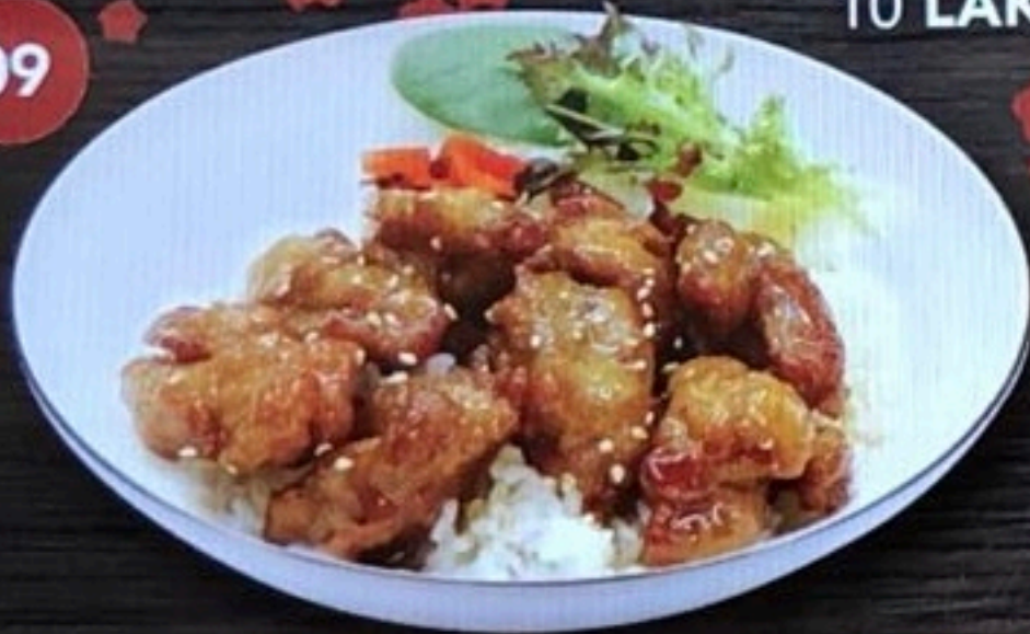
09 HONEY SOY KARAAGE $9.8