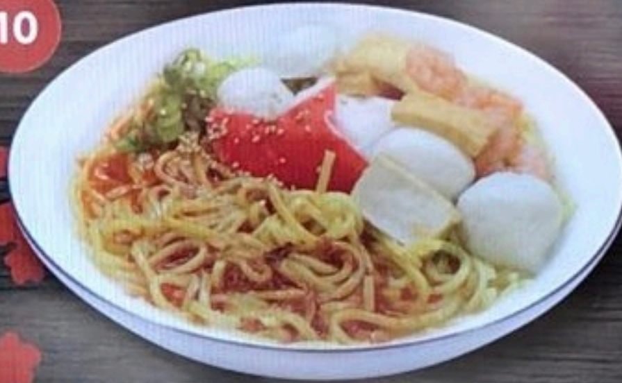
10 LAKSA SEAFOOD OR KARAAGE NOODLE SOUP $9.8