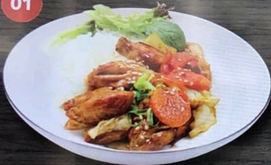
01 TERIYAKI CHICKEN $9.8