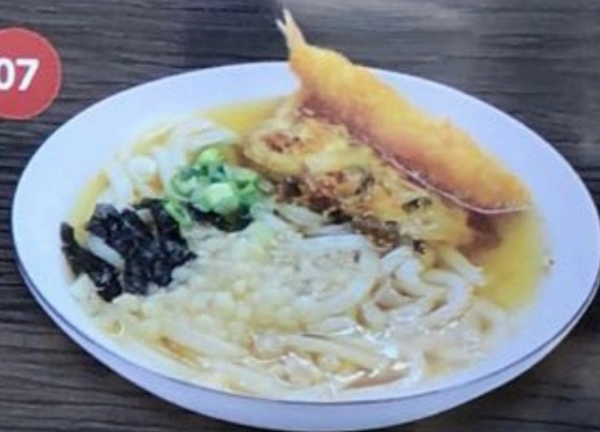
07 TEMPURA UDON OR KARAAGE UDON $9.8