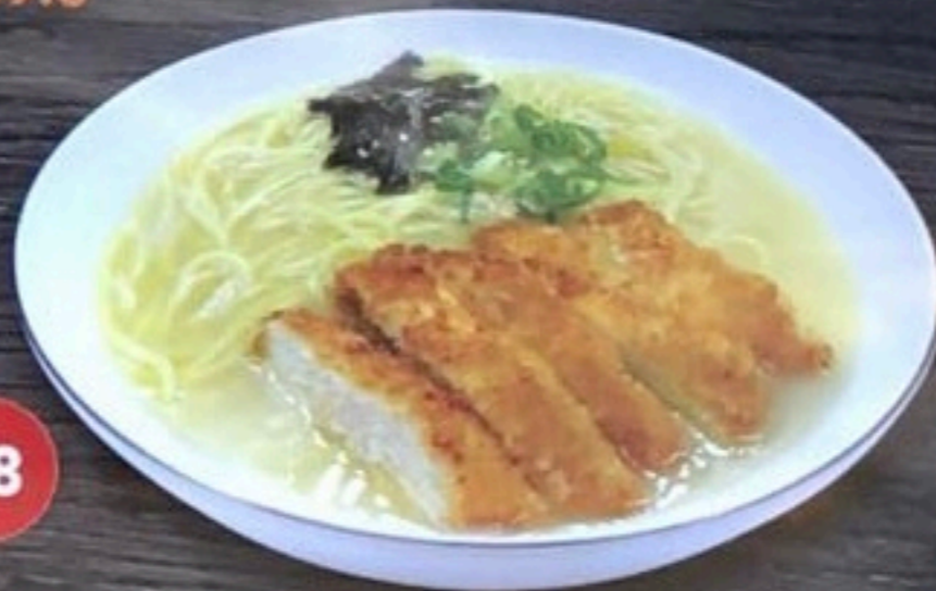
08 JAPANESE RAMEN : CHICKEN OR PORK $9.8