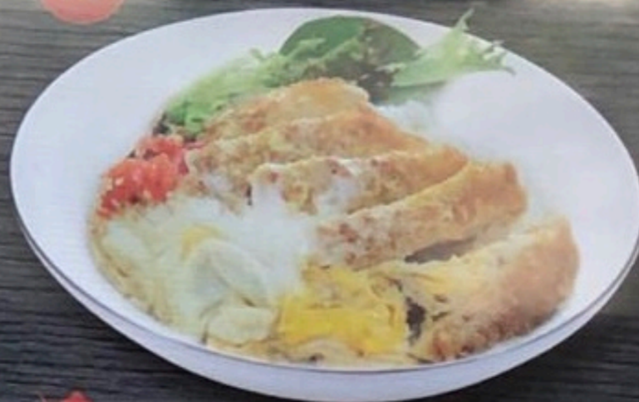
03 KATSUDON : CHICKEN OR PRAWN OR PORK $9.8