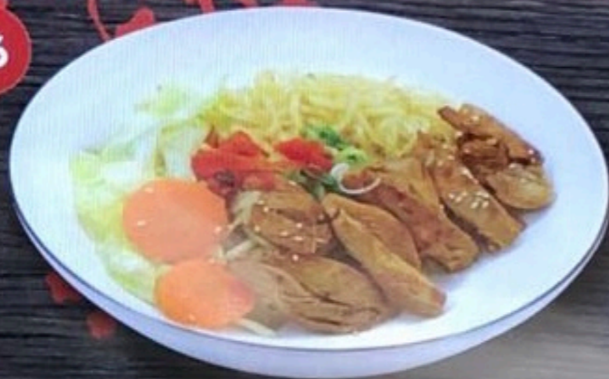
06 FRIED SOBA $9.8