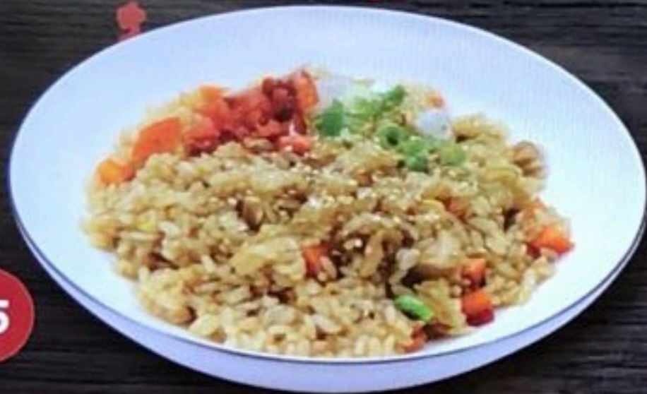
05 FRIED RICE $9.8