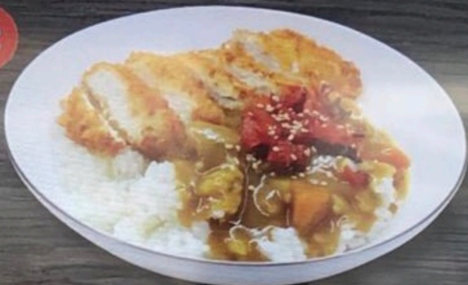
02 JAPANESE CURRY : CHICKEN OR PORK OR PRAWN OR TEMPURA VEGE $9.8