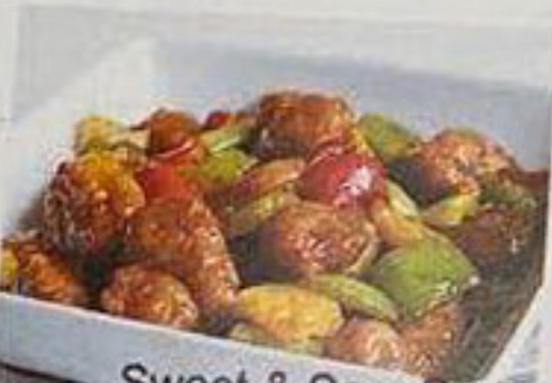
Sweet & Sour Pork