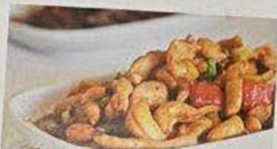
Chicken and cashew nuts