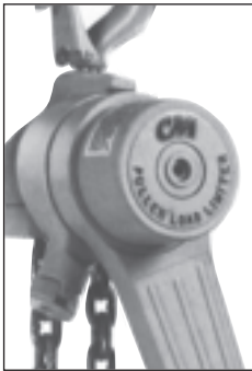
Optional Load Limiter