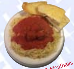
Spaghetti & Meatballs