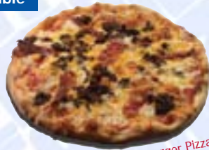
Bacon Cheeseburger Pizza