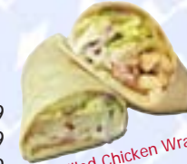
Grilled Chicken Wrap