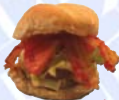
Double Bacon Cheeseburger