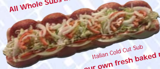
Italian Cold Cut Sub

All Whole Subs include a side of Potato Chips