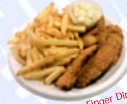
Chicken Finger Dinner