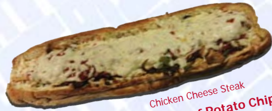
Chicken Cheese Steak

All Whole Subs include a side of Potato Chips