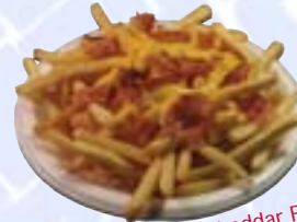
Bacon Cheddar Fries