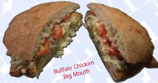
Buffalo Chicken Big Mouth