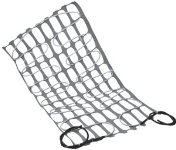
Slab Snow Melting Mats