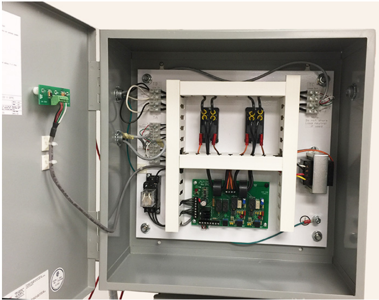
Enclosure Dimensions start at 16" x 16" x 7"