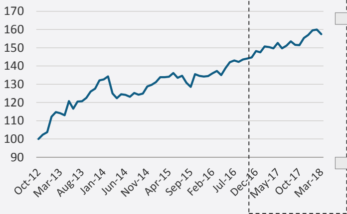
Source: Odey Asset Management LLP, Latitude Investment Management LLP