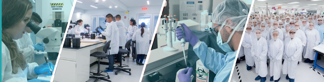
University of Puerto Rico- Mayagüez, Puerto Rico Vector Control Unit, Boston Scientific Puerto Rico