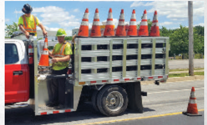
Highway Service Stake Body