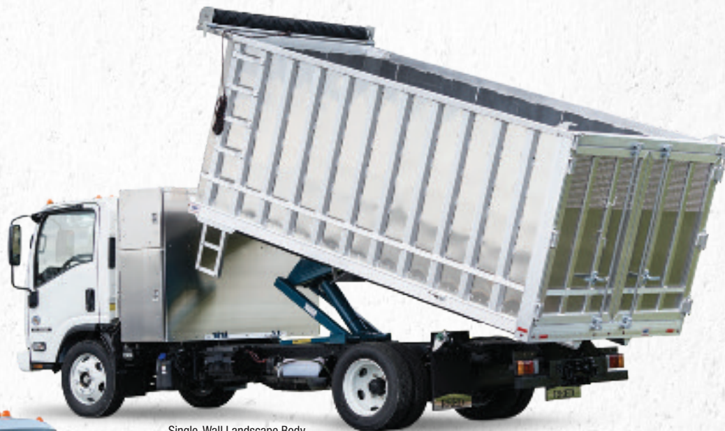
Single-Wall Landscape Body, shown with custom back-pack tool box and barn doors