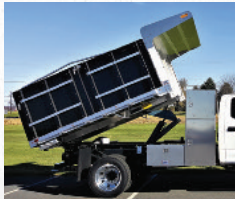
Landscape Dump Body