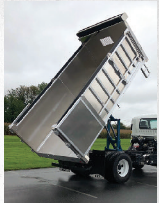
Aggregate and Grain Body