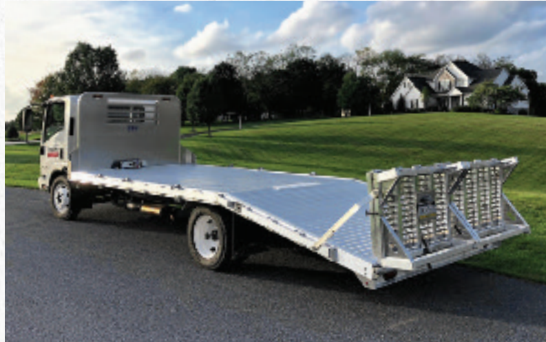
Beaver-Tail Equipment Body

At EBY Truck Bodies, we love designing truck bodies and equipment with work in mind. From our roots building wood and steel cattle bodies back in 1938, to our all-aluminum product line of heavy-duty truck bodies and trailers today, we've grown because we always remember that your business is unique. Listening to customers and building heavy-duty equipment that makes their lives easier is what makes us tick. We appreciate your business, and look forward to growing with you.