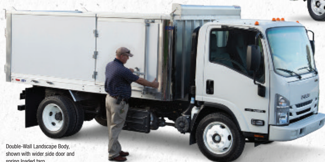
Double-Wall Landscape Body, shown with wider side door and spring loaded tarp

You built your landscaping business by working harder than your competition. Work smarter and get more done by stepping up to an EBY landscape truck body. One that doesn't rust. One that delivers more payload and requires less maintenance than steel bodies. EBY truck bodies save you money by out-loading, out-working, and out-smarting the competition.