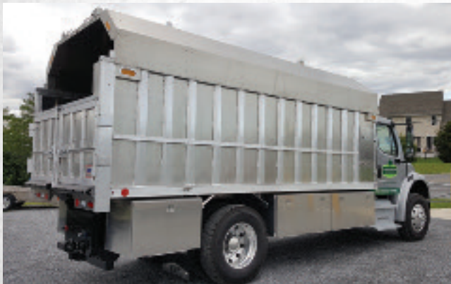
Tree Chipper Body