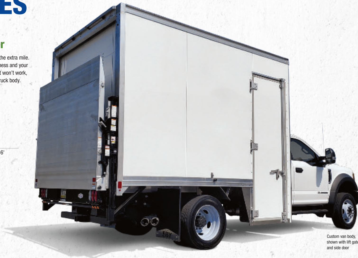
Custom van body, shown with lift gate and side door