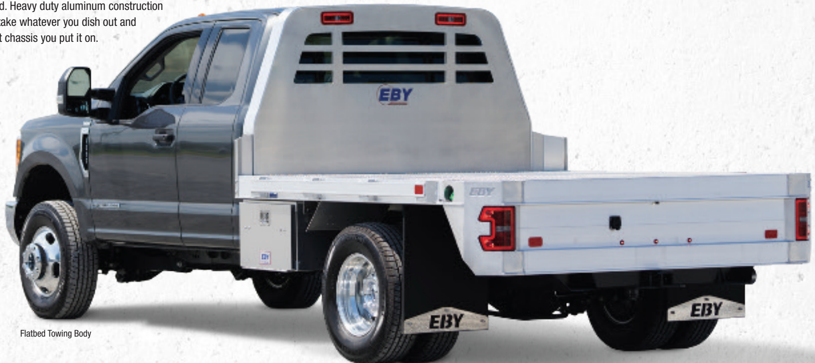
Flatbed Towing Body

Big Country is the standard by which all other aluminum flatbed towing bodies are measured. With a standard trap door for a gooseneck hitch, you can pull your livestock trailer, equipment trailer, or RV and still have plenty of room for cargo in the bed. Heavy duty aluminum construction means your Big Country bed will take whatever you dish out and always look great, no matter what chassis you put it on.