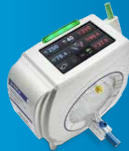
Nautilus™* Smart ECMO Module