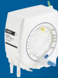
Nautilus™* ECMO Oxygenator