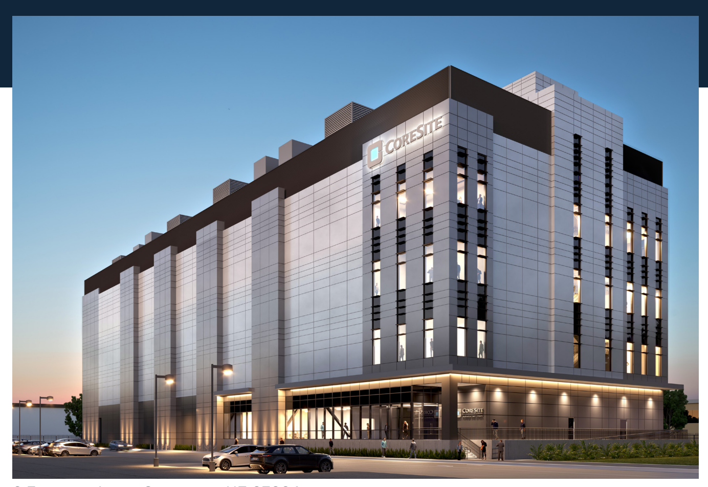
2 Emerson Lane, Secaucus, NJ 07094