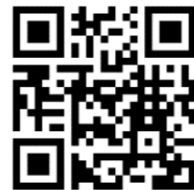
For more products please visit