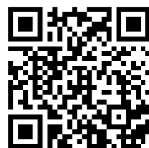
How to use RollnJack