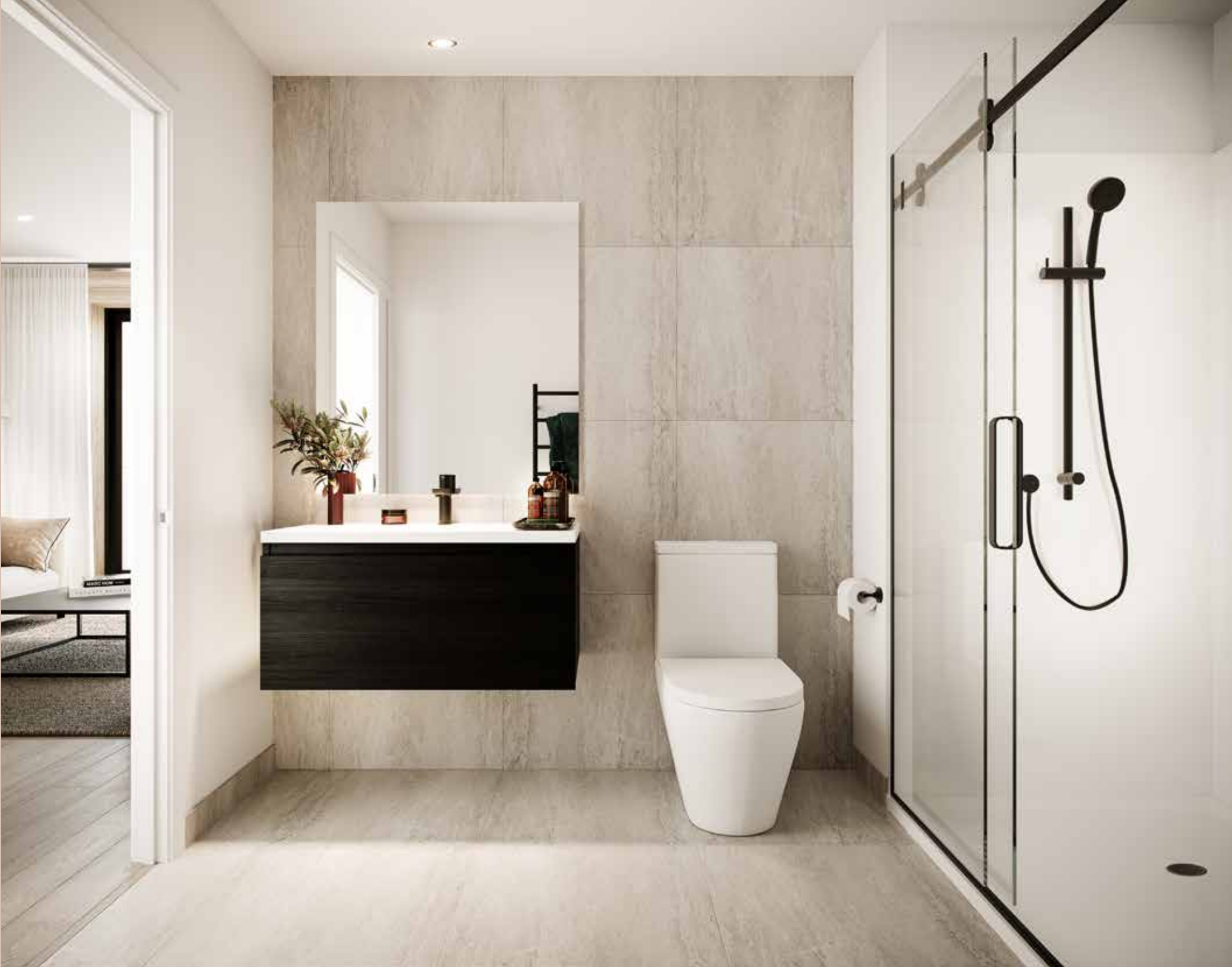
Opposite and above: The dark vanity and black fittings contrast with the white walls and pale tile in an attractive bathroom design