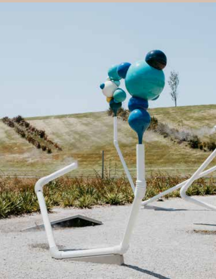
Left: 'Upon A Pond' Interactive installation by artist Seung Yul Oh, Albany Stadium Pool