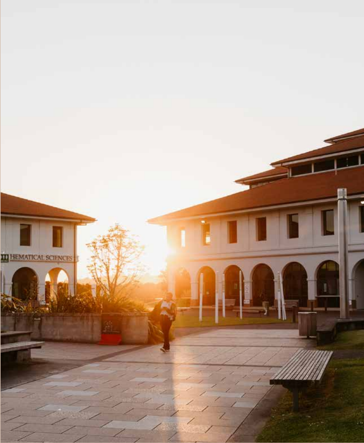
Clockwise from left: North Harbour Stadium; Massey University; Black Rice Restaurant