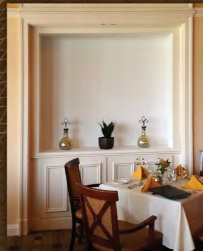
A beautiful example of what can be created for your members in an otherwise unused space.