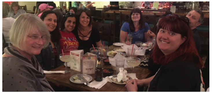
Teachers enjoying the last OMTA social of the year. Be sure to visit OMTA on Tuesday May 8, from 1pm-5pm, for our 3rd annual Teacher Appreciation Celebration.

We choose to put ourselves out there in hopes of making a change for the better - we enjoy learning with and from others. Happy Learning! 🍏