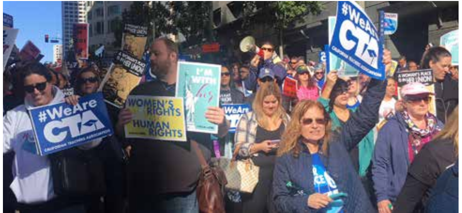
CTA Members participate in the LA Women's March on January 20, 2018