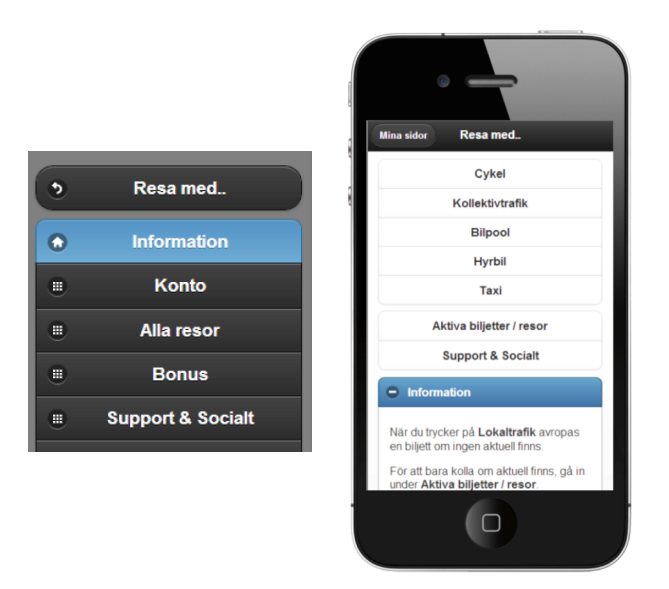
Figure 1: UbiGo website-based app. Left = main menu (top to bottom) travel with, information, account, all trips, bonus, support & social. Right = "travel with" menu (top to bottom) bicycle, public transportation, carsharing, car rental, taxi, valid tickets/trips, support & social.