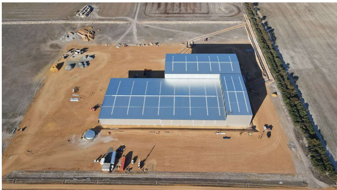
Figure 2. Aerial view of Wickepin Plant currently under construction