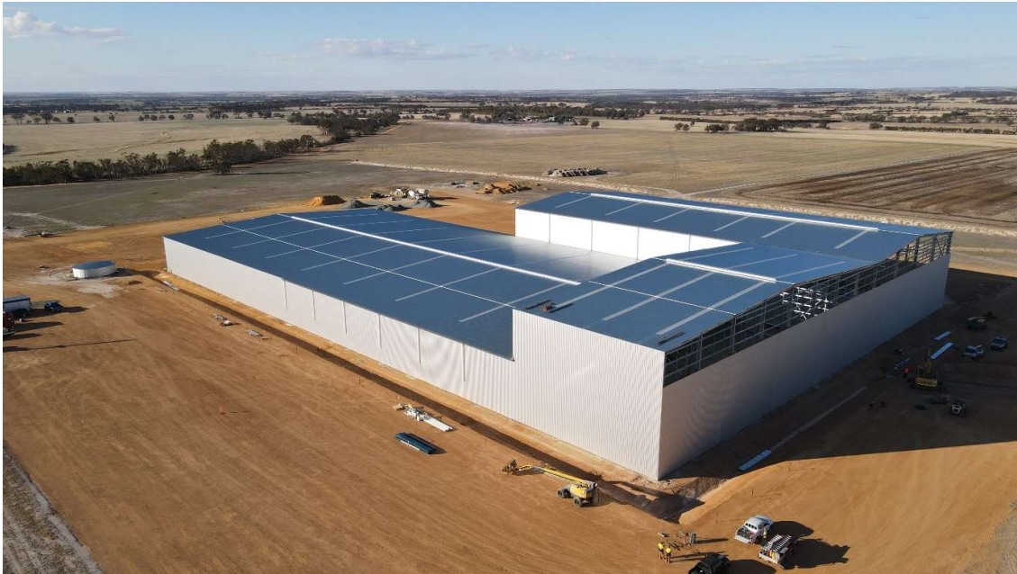
Figure 1. Stage 1 Building Works continue at Wickepin

Building works onsite at Wickepin continue in earnest with 100% of the building structural steel and roofing completed to date. AUSPAN, one of Australia’s leading steel frame construction companies which was contracted to carry out the design and construction, continues to deliver first quality work on target, with 75% of the flooring and 50% of the wall cladding already completed.