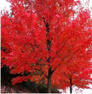
Autumn Blaze Maple