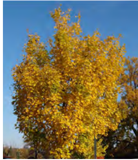
State Street Maple