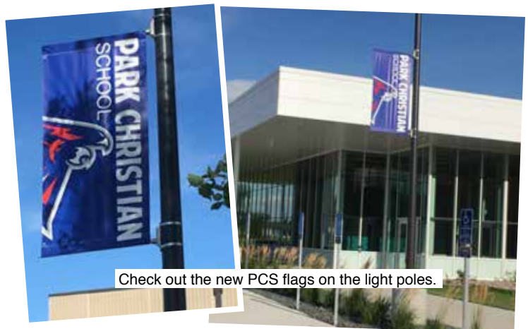
Check out the new PCS flags on the light poles.