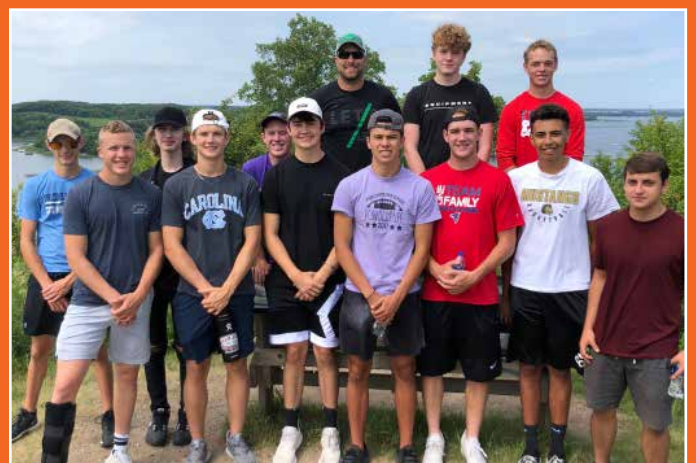
Senior Boys' Outing