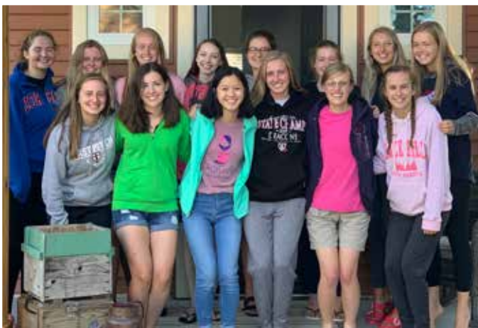
Senior Girls' Outing

AND LET US CONSIDER HOW WE MAY SPUR ONE ANOTHER ON TOWARD LOVE AND GOOD DEEDS, NOT GIVING UP MEETING TOGETHER, AS SOME ARE IN THE HABIT OF DOING, BUT ENCOURAGING ONE ANOTHER—AND ALL THE MORE AS YOU SEE THE DAY APPROACHING. -HEBREWS 10:24-25